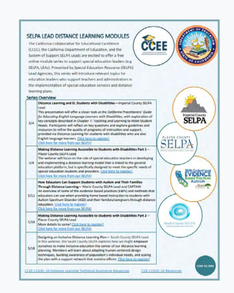
>> Click <u>here</u> for the SELPA Leads Distance Learning handout.

>> Click <u>here</u> for the Distance Learning Consortium handout.