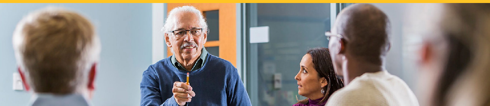
Table 2 provides an overview of CoPs, LPLs, and leadership coaching, describing each type of offering according to the 21CSLA Cohort 2 Guidance Document provided to RAs. 5 The guidance emphasizes that these offerings are grounded in four principles related to (1) equity-focused goals, (2) research-based approaches to targeting goals, (3) ongoing learning opportunities, and (4) evaluation and continuous improvement related to program effectiveness. The document also aligns the design of offerings to a research base and existing professional learning standards,

and includes considerations framed as questions to guide structures, processes, content, and continuous improvement approaches for each offering area.